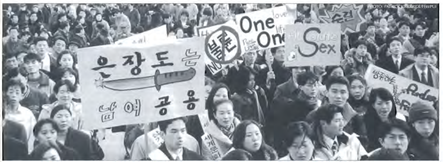
Blessing participants and members attend a rally for pure love in Pagoda Park, central Seoul, February 5