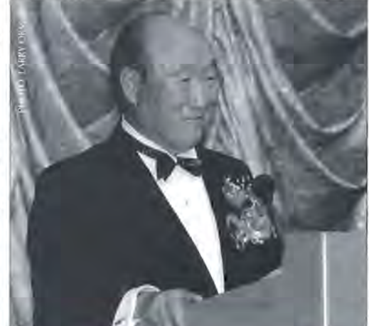
Father addresses the Convocation participants on the first of three official occasions

have to push forward one step at a time. There is no time to get entangled with the opposition. You have to keep going as quickly as you can, even if just one step at a time, in order to traverse your path of destiny to its end and finally cross the finish line. We all must go this way.