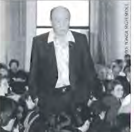
Bringing his message to the members

a big rally. A grandson will tell his grand-father that he saw something great on February 7. Can anyone find fault with this? Such a time has come. Tell the president he can entrust family problems to you. You have a patent on the solution. So we can bring life and save people from sexual immorality everywhere. The age has come to organize seven generations through the 180 families. Those who do so are called Sa-du . Organize a tribal meeting. Give gifts.