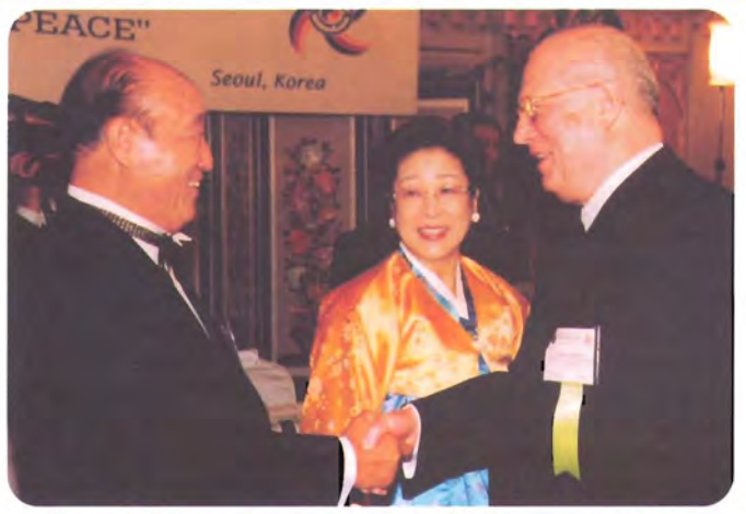
Above: VIP reception prior to opening banquet, Feb. 4